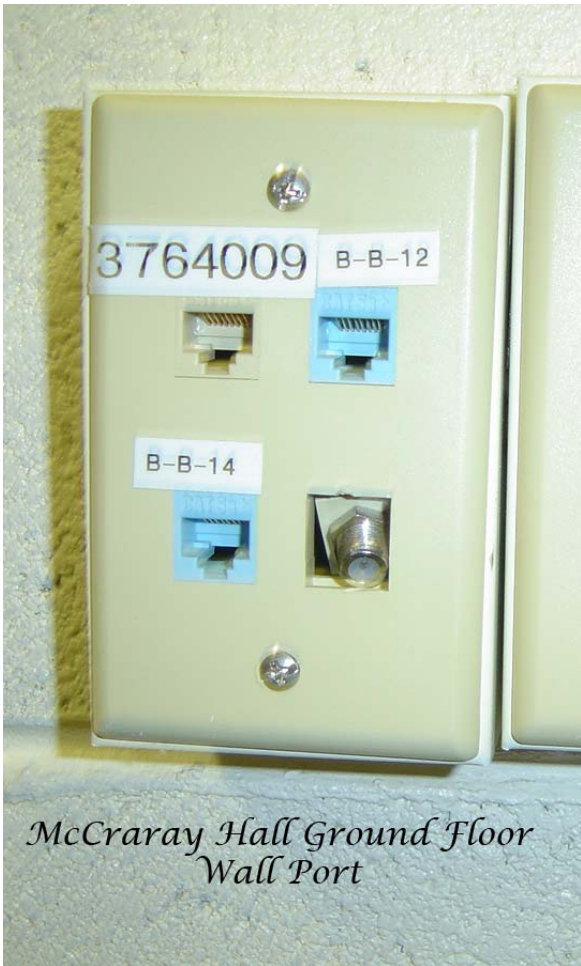
McCraray Hall Ground Floor Wall Port