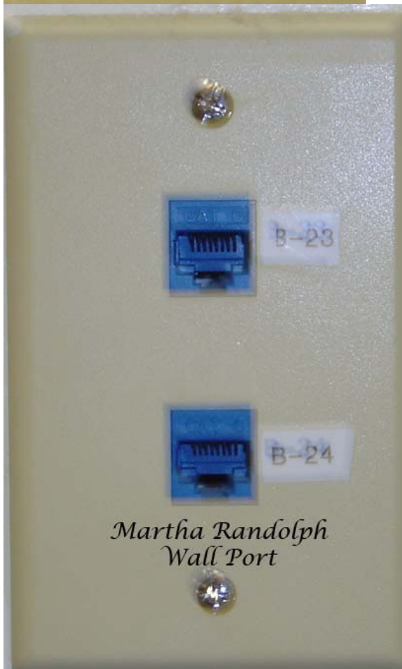
Martha Randolph Wall Port

If you live in Henson Hall, you should look for the BLUE Ethernet jack. Your port number will be located above your Ethernet jack. Please note that your port number will NEVER have a letter “V” in its label.