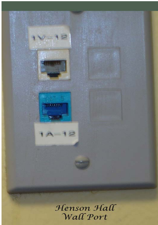
Henson Hall Wall Port